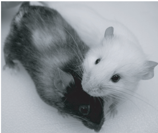
Figure 2: W^{sh} mice as a model of vitiligo insufficiency. A vitiligo affected mouse (left) and a W^{sh} mouse (right).

Using the W^{sh} model, we have recently found that the absence of melanocytes impairs the development of T cell memory to melanoma [9]. Our data show that W^{sh} mice prime gp100-specific CD8 T cells that are equivalent in frequency and phenotype to wild-type hosts. However, they are unable to develop the robust effector memory T cell responses that characterize hosts with vitiligo [9]. Instead, melanocyte-deficient mice develop small, T_{CM} populations, similar to those in vitiligo-unaffected wild-type mice [9]. Moreover, when gp100-specific CD8 T cells were first primed in tumor-bearing W^{sh} mice, and then adoptively transferred into melanocyte-sufficient mice with vitiligo, the unique T_{EM} phenotype and homing function of these T cells was restored [9]. Thus, the fate of melanoma antigen-specific CD8 T cells was not pre-determined at priming, but rather was altered by exposure to melanocyte destruction. Additionally, robust populations of gp100-specific T_{EM} cells could be rescued