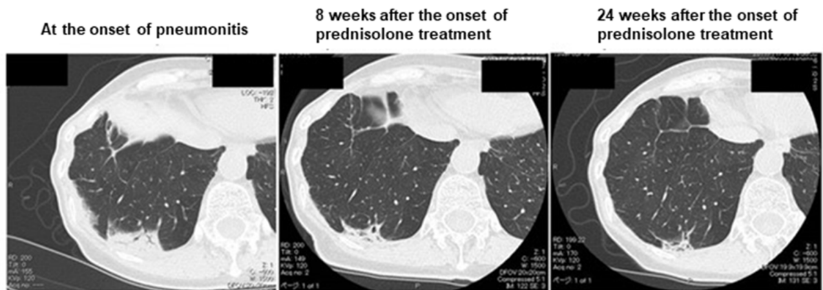
Figure 1: Chest CT scans of the patient. (A) Clinical course of the pleural effusion and metastatic tumors. (B) Clinical course of the pneumonitis.