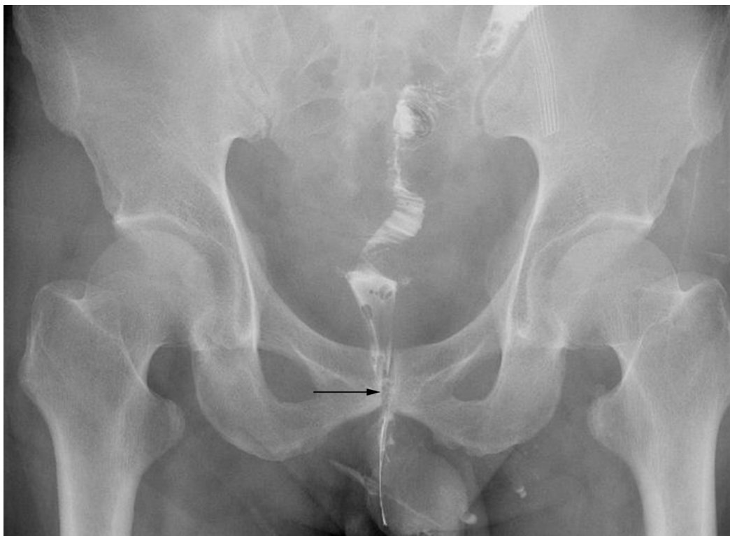
Figure 3: The gastrointestinal contrast showed the stenosis (black arrow) proximal to anastomosis.

by wall stiffness might result in intestinal obstruction. All the symptoms aforesaid were possible indicators for non-reversal of stoma. Previous studies had provided limited data on the research of bowel wall stiffness and the testing methods were not optimal [24, 25]. Krol et al. used barostat to measure rectal distensibility and found the decrease of rectal cavity and compliance [23]. In the present study, although accurate function tests had not been done by technique, digital rectal examination and colonoscope did confirm the existing of bowel wall stiffness. In some patients, the bending intestine with stiff wall could even prevent the passage of colonoscope, which was a contraindication for stoma reversal. During the period of follow-up, 2 patients underwent stoma reversal at first ended up with colostomy. No stenosis but bowel wall stiffness was found in these two patients which reminded us that stoma closure might be chosen cautiously in such patients. It was interesting to point out that the bowel wall stiffness in most patients were located proximal to anastomosis. Some investigators recommended the resection of the whole intestinal segment contained in the