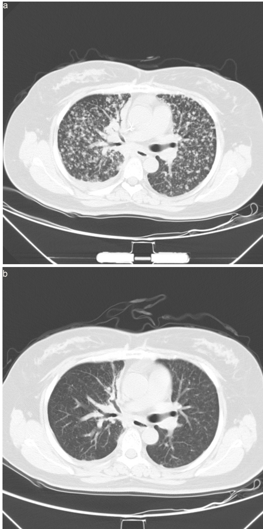
Figure 2: Computed tomography scan images of lung prior and post-AZD9291 treatment. a. Disease progressed in Dec,2015 after treatment of erlotinib and chemotherapy, prior-AZD9291. Patient had symptoms of cough and short of breath. b. Partial response after one month of AZD9291 treatment. Symptoms were much relieved.