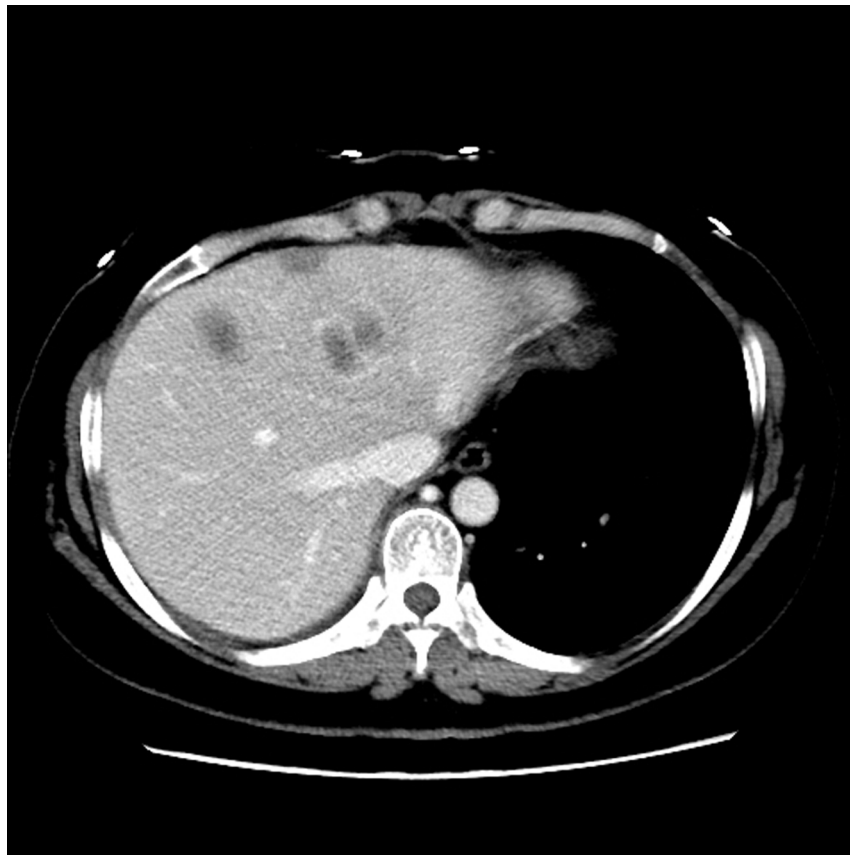
Figure 3: Computed tomography scan images showed new hepatic lesions appeared after 6 months of AZD9291 treatment.